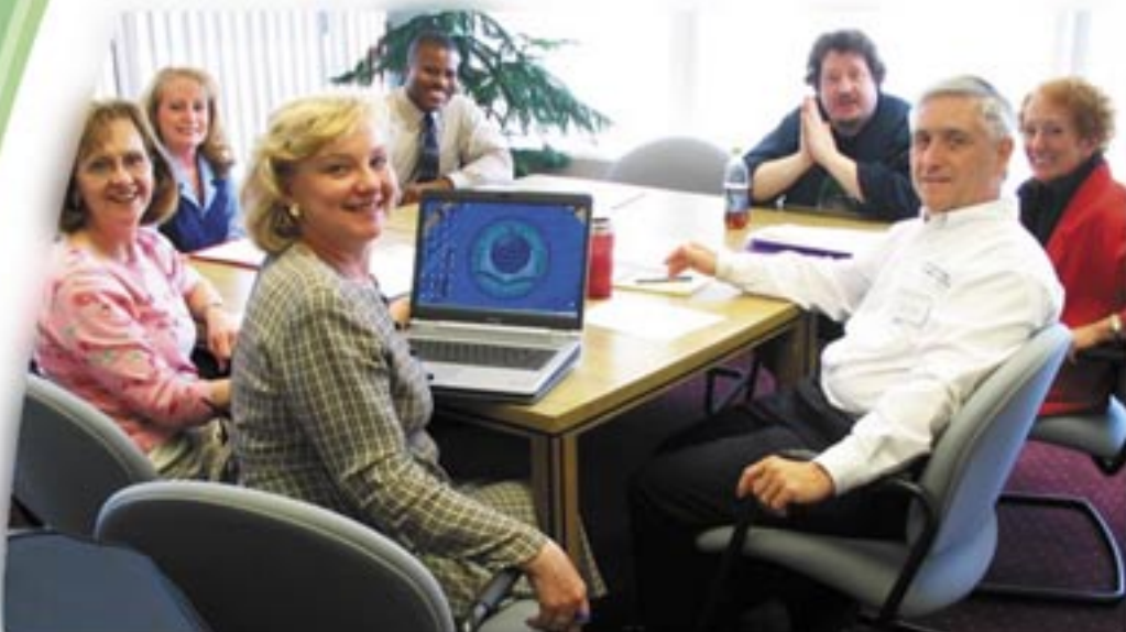
A group of your teachers and professors at work in a planning session for summer classes.